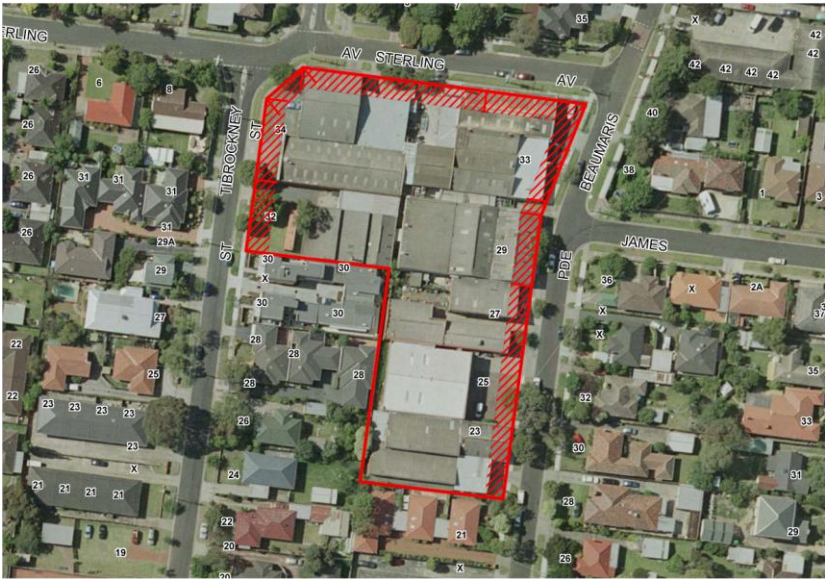
6 metre Street Setback