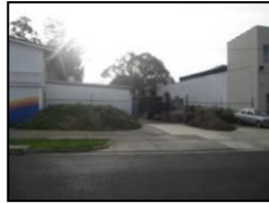
1 Noyes St