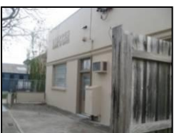
3 Sydenham St