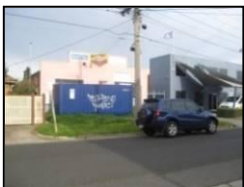
4 Noyes St