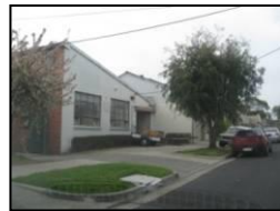
27 Beaumaris Pde