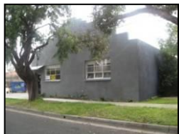
23 Beaumaris Pde