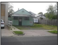
5 Noyes St