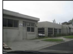
29 Beaumaris Pde