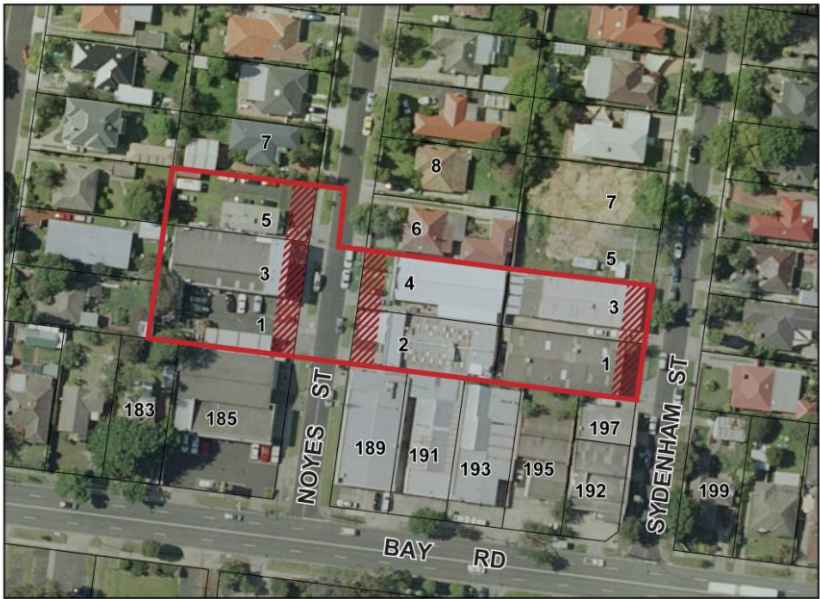
6 metre Street Setback