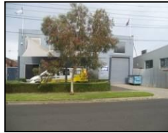
2 Noyes St