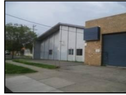
34 Tibrockney St