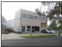
3 Noyes St