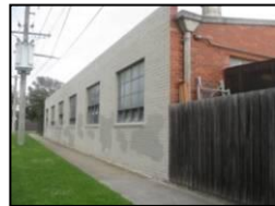
31-33 Beaumaris Pde (Sterling Ave frontage)