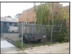
1 Sydenham St