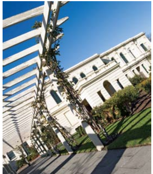
Brighton Town Hall

Beaside's coastal parks are among Victoria's most glorious attractions. Spanning from Brighton to Beaumaris, they boast many natural features to contribute to your perfect day. The foreshore offers parking, conveniences, open space and the tranquility of rolling waves.