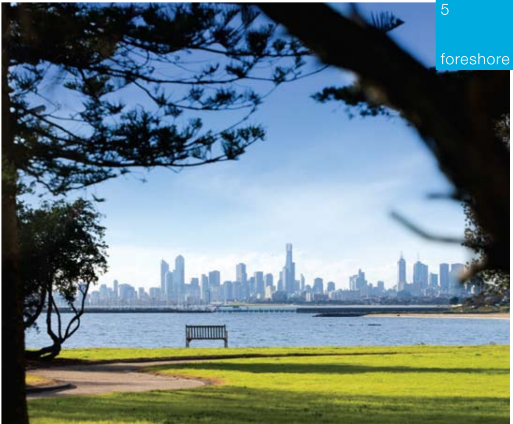
Brighton Beach Gardens