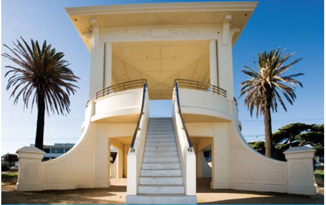
Band Rotunda, Sandringham