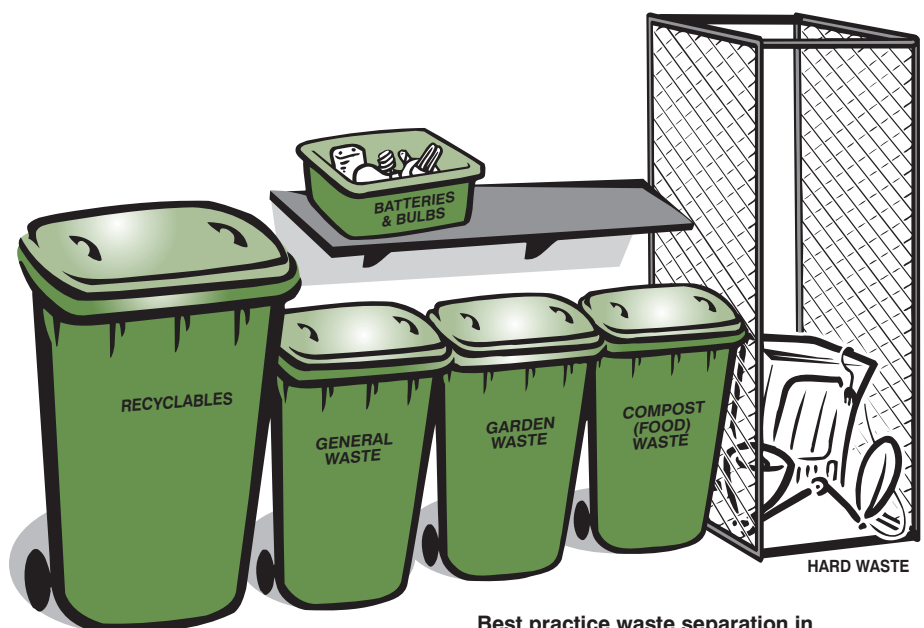
Best practice waste separation in multi-unit residential developments.

Construction sites can represent a great burden on local waterways. Site litter, paint, solvents, bricks, cleaning substances and clean-fill can all contaminate stormwater runoff. It is an offence under the Environment Protection Act to discharge contaminated water into the stormwater system. To avoid contamination, ensure that a drainage system is installed before construction activities commence and storm water is diverted from areas where soil is exposed.