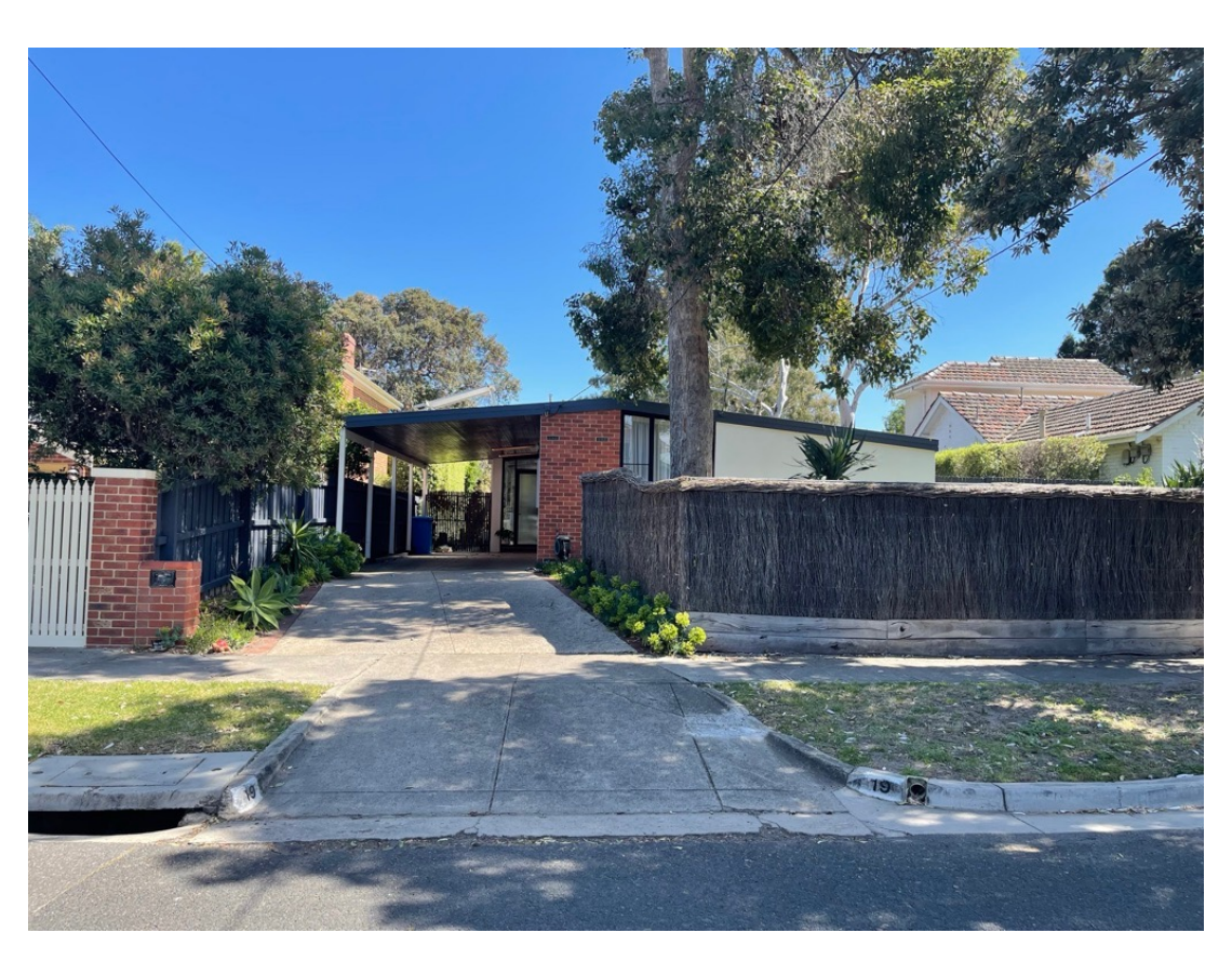
19 Haldane Street, BEAUMARIS 54 Haldane Street, BEAUMARIS