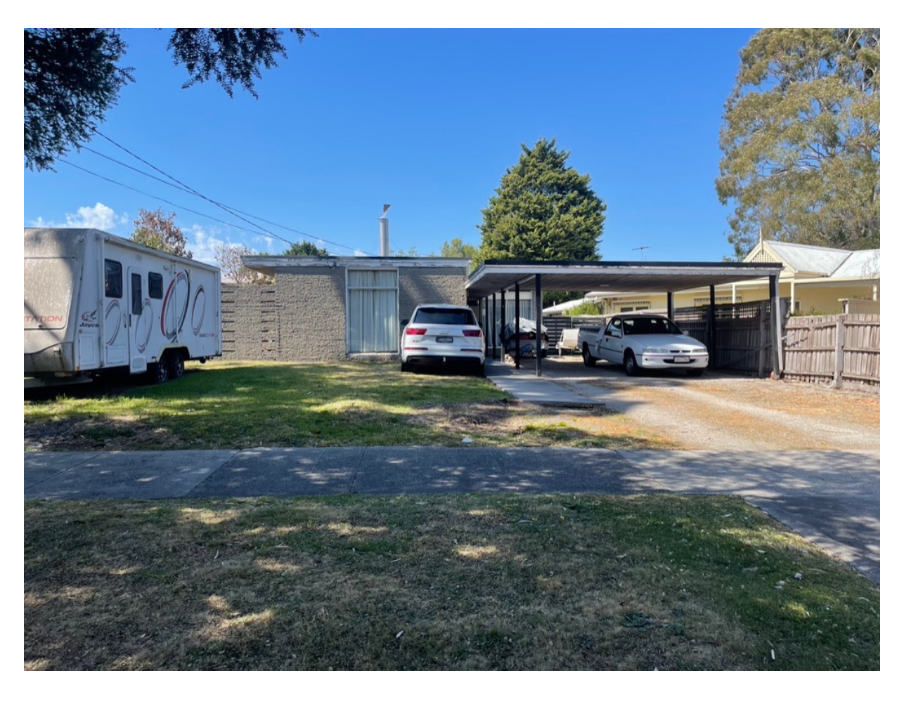
•132 Tramway Parade, BEAUMARIS