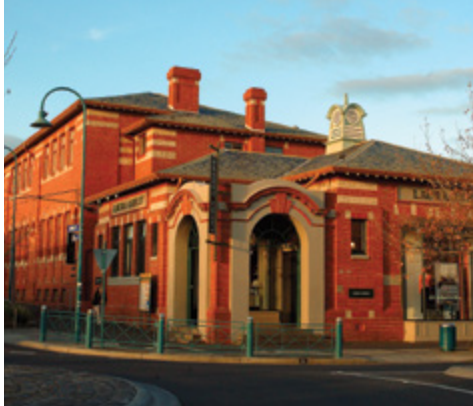
Former Brighton Post Office & Automatic Exchange