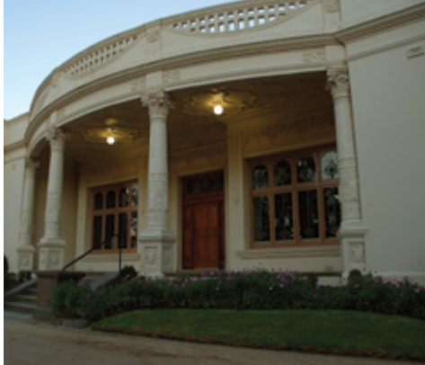
Billilla Bayside Architectural Trail Trail 4 Property 4