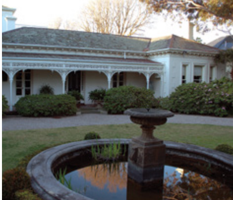
Chilton Bayside Architectural Trail Trail 4 Property A