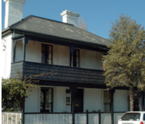
Itasca Bayside Architectural Trail Trail 4 Property 11

The first Brighton rate books are dated 1859, when Itasca was known as Craigmillar, and was already firmly established as a house and brewery. It is one of the few houses remaining that pre-date the rate books.