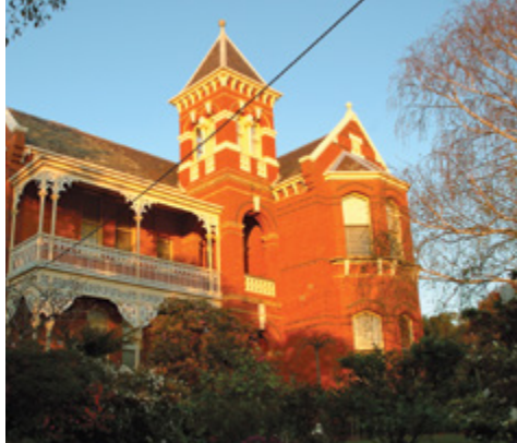
Wilton Bayside Architectural Trail Trail 4 Property 7