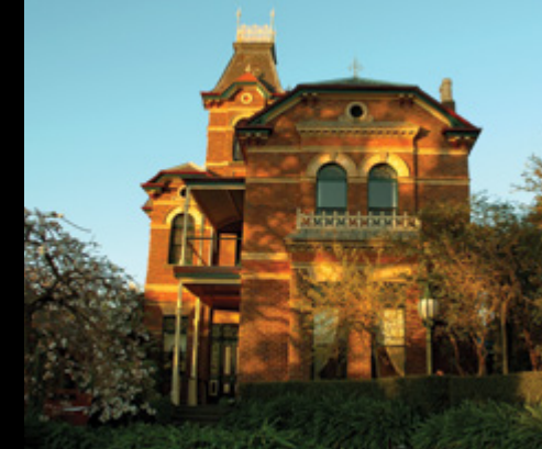
Marama Bayside Architectural Trail Trail 4 Property 6