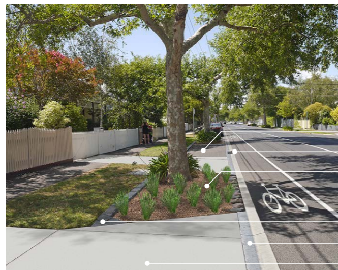
Artist impression of typical proposed works